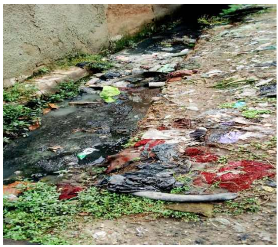
The above picture shows the poor sanitation condition of residential area in some part of Minna

The above state is also in line with world health organization assertion made coup with other expert in the field, in respect to environmental sanitation.