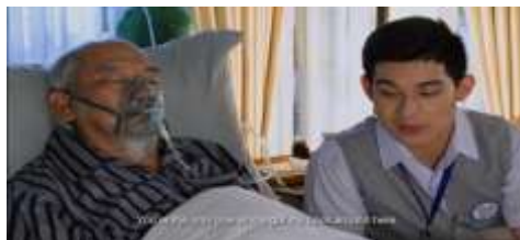
Figure 1. Still Cut of Luis and his grandfather- Mga Batang Poz

In the series, Luis has seen that he is always watching over his grandfather, who is in a coma. He kept on monitoring if his grandfather was already awake, and during those times that his grandfather was awake, he is the one who feeds him in bed, and he does sponge baths for his grandfather.