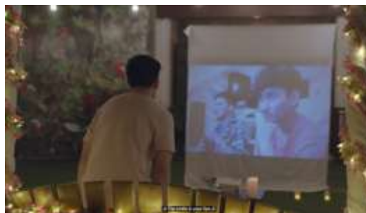
Figure 7. Still Cut of Karl and Vlad- Gaya sa Pelikula

In Gaya sa Pelikula , the characters of Vlad and Karl, tend to express their love for each other through acts of service and physical touch. It has been seen how Karl went out of his way for Vlad on his birthday, and how Vlad went out of his way to take clips of his memories with Karl and make a compilation for them, which made Karl sentimental in the latter part of the series.