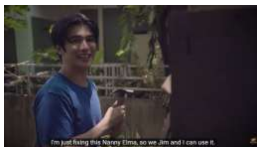
Figure 2. Still Cut of Ben- Ben x Jim

In Ben x Jim , it has been perceived that most of the character's actions in the series portray love. It has been implied in the series that when Ben found out that Jim would return to their place, he repaired the tree house that he and Jim used to play at when they were kids. Even if they are now adults, Ben feels the urge to repair it so that it can serve as their hangout place to reminisce about all their childhood memories the moment Jim arrives.