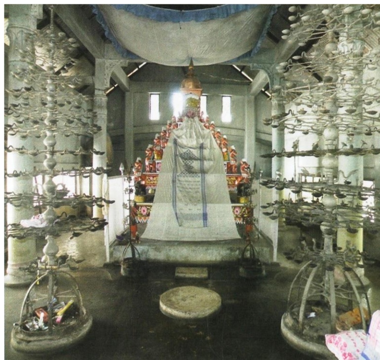
The Sankardeva Than Patbaushi Satra's Guru Ashan