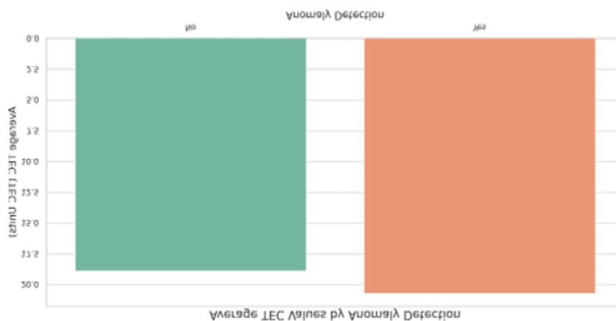
Figure 1. Bar Plot Visualizing the Average TEC Values for Events with and without Anomaly Detection