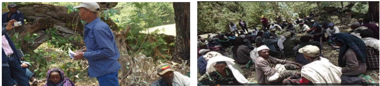
Figure 6: Public discussion between community and experts.

Kyalo et al. (2016) also stated local people's involvement in the monitoring and evaluation phases of ecotourism growth is crucial for sustainable ecotourism development. Because, they possess valuable knowledge and can be excellent information gatherers, this allowing for better observation of wildlife and identifying economic and social impacts. This involvement strengthens the link between ecotourism planning and management and its beneficiaries, typically local residents. Involving locals in ecotourism monitoring and evaluation also gives them a stronger incentive to plan and manage activities sustainably. Resident participation in this stage is crucial for the sustainable development of ecotourism projects in the destinations.