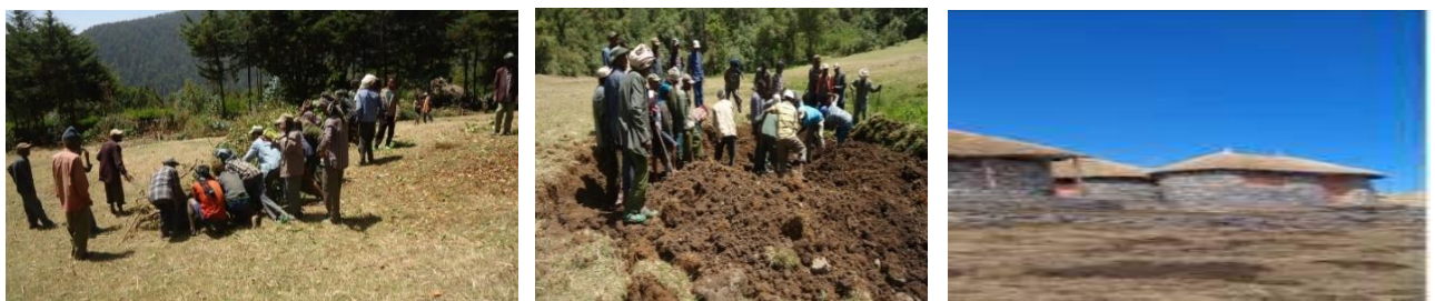
Figure 5: Community participation during lodge building.

raw materials, and generating ideas. Besides, promoting the ecotourism project through offered local and traditional products in specific market site for example at Menelik Window, followed day to day operation, as well as solved conflicts via traditional way (Interview, April, 2024). It concur with Sunu et al., (2019) findings, community participation is necessary for the success of ecotourism programs throughout the implementation phase. They help through provision of raw materials, monetary donation, handling possible conflicts of interest, ensured equitable rewards, supplying skilled labour, creating community-based enterprises associated with ecotourism, and moral support. Involving them in planning and execution ensures sustainability, empowers people, and boosts knowledge, skills, and incomes.