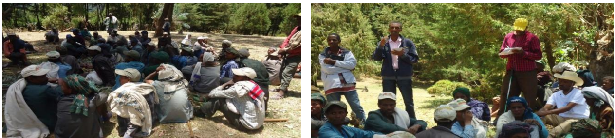
Figure 4: Public discussion among community, experts, and NGO bodies.

Sunu et al., (2019) also concluded that incorporating communities' viewpoints into ecotourism planning and development is a crucial component of sustainable ecotourism development. They have done several activities, such as providing evidence to the public regarding the planned development of the ecotourism project, shaping ecotourism project objectives with community priorities, formulating the development goal, and defining the problem. Generally, the engagement of the local community in the planning of the ecotourism project is essential.