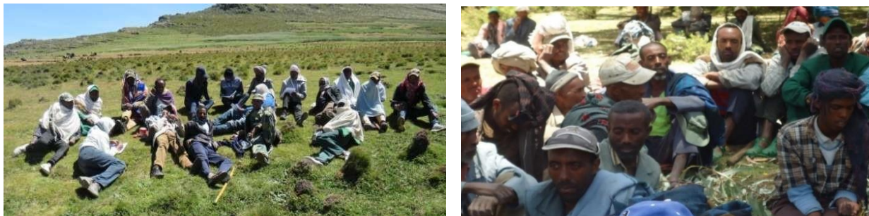
Figure 3: Public meeting between community and other stakeholders.